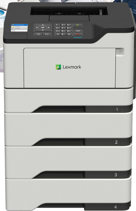
MS521dn with optional trays